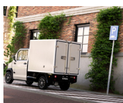
Last mile delivery