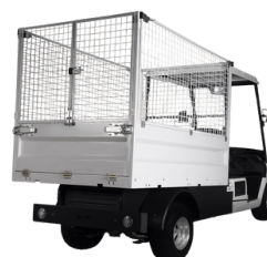
Mesh Box PCW (180x130x130)