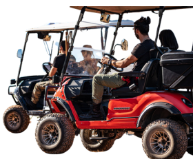
Lifted / Off-road