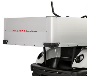
Alu Box PC (100x110x40) Alu Box ES (70x110x27)