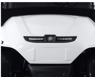
Standard LED light