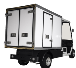
Closed Box PCW (175x124x130)