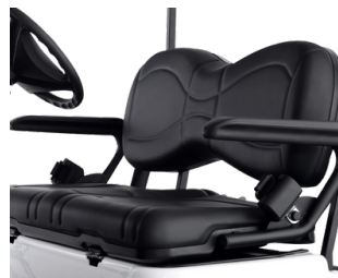
Standard Golf Seat